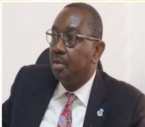
Hon. N. Oswald Tweh Minister of Justice, Member