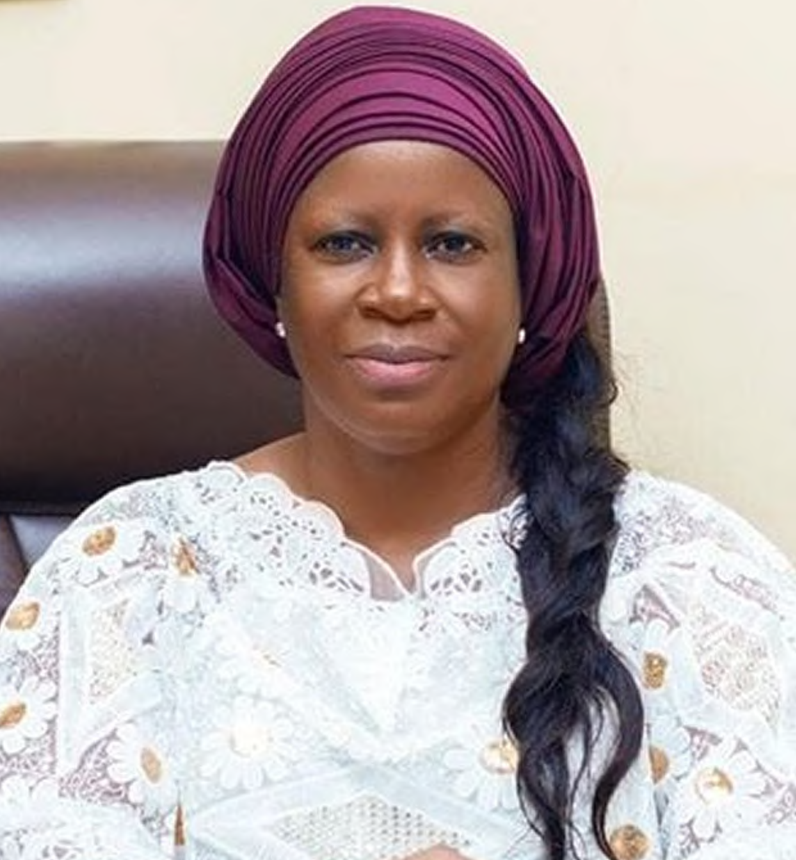
SENATOR NYONBLEE KARNGA-LAWRENCE PRESIDENT PRO TEMPORE OF THE LIBERIAN SENATE