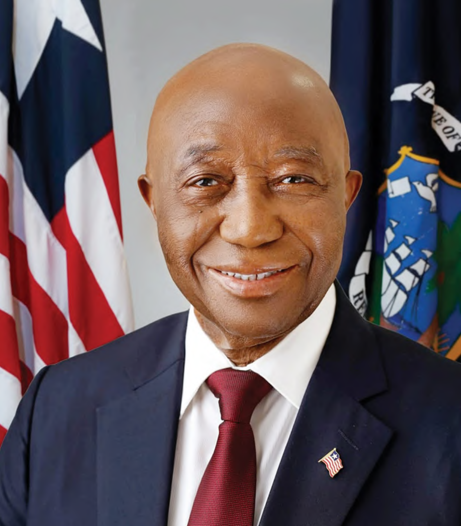
HIS EXCELLENCY JOSEPH NYUMA BOAKAI, SR. PRESIDENT OF THE REPUBLIC OF LIBERIA