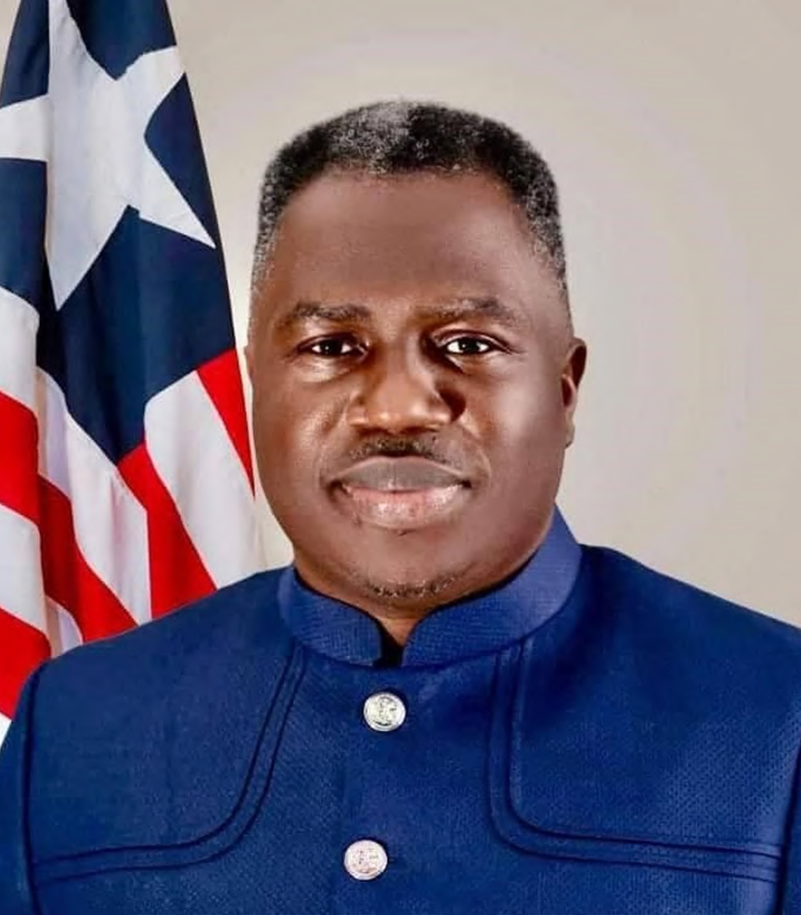
HONORABLE JEREMIAH KPAN KOUNG VICE PRESIDENT OF THE REPUBLIC OF LIBERIA