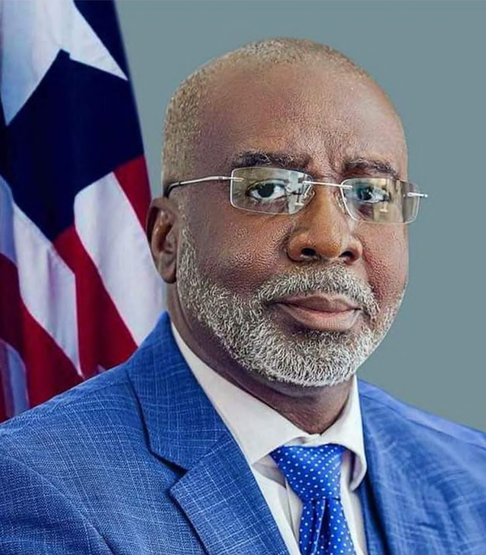
HONORABLE J. FONATI KOFFA SPEAKER, THE HOUSE OF REPRESENTATIVES