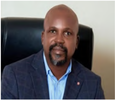
Hon. Roland Layfette Giddings Minister of Public Works, Member